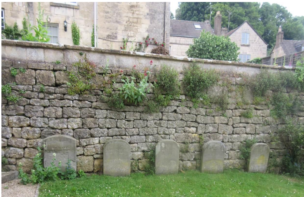
Figure 2: Headstones in Meeting House Court